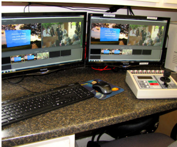
Wayfarers Chapel's workstation

“We stream our wedding ceremonies and Sunday services to Sunday Streams,” says Steve. “Sunday Streams has been extremely accommodating and helpful in developing a solution for our needs and the volume we anticipate. Couples who choose the streaming option can enjoy their wedding as Video On Demand for two weeks after the wedding. We record an HDV signal on DV tape on the camera for backup and archival, Apple Pro Res files are recorded on the Atomos Ninja 2’s for possible post production editing for Blu-Ray encoding and burning. Simultaneously, Wirecast allows us to record an .mp4 file of the live mixed ceremony/program locally. At the conclusion of the ceremony we drag and drop to a DVD Data Disc or thumb drive and present to the couple as they leave the grounds, approximately 40 minutes after the ceremony is over. The DVD is preprinted with the couples’ names and date, and the optional thumb drives are imprinted with a Wayfarers logo.”