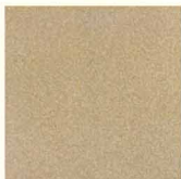
Yuca Tan All Models (2)