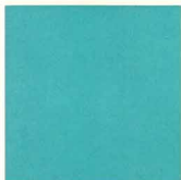
Surfside Turquoise Gremlin (1), Hornet & Javelin