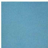
Jetset Blue All Models