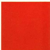
Trans-Am Red All Models (1)