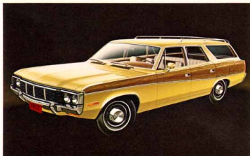
Matador Station Wagon