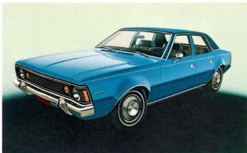
Hornet SST 4-Door Sedan