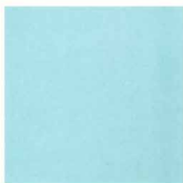
Skyway Blue Gremlin & Hornet