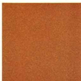
Baja Bronze All Models