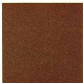
Cordoba Brown Javelin, Matador & Ambassador