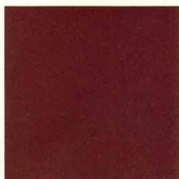
Sparkling Burgundy Javelin, Matador & Ambassador