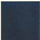
Admiral Blue Javelin, Matador & Ambassador