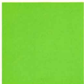
Jolly Green Gremlin (1), Hornet & Javelin