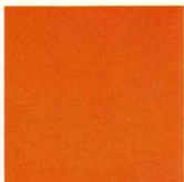
Butterscotch Gold Gremlin (1) & Hornet