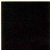
Classic Black (Extra-cost Option)