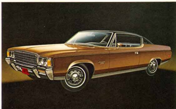
Ambassador Brougham Hardtop