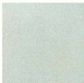
Stardust Silver All Models (1)