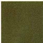
Hunter Green All Models (2)