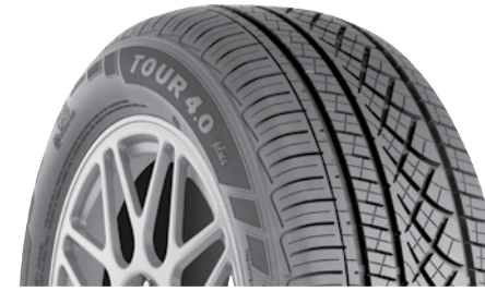
Hercules Tour 4.0 ® plus M+S Rated