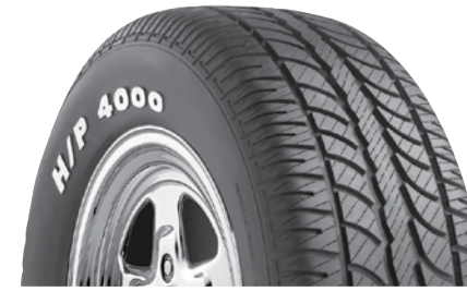
Hercules H/P 4000 M+S Rated