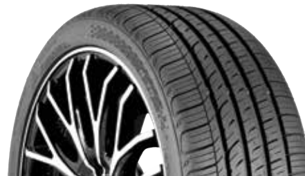
Hercules Raptis® R-T5 M+S Rated