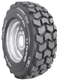
BKT JUMBO TRAX HD