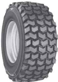
POWER KING RIM GUARD ND