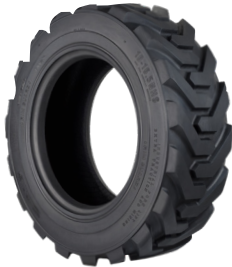
POWER KING RIM GUARD SD