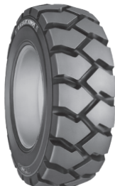
BKT POWER TRAX HD