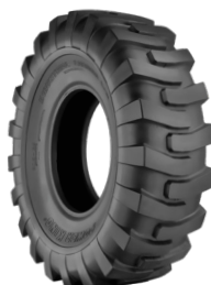
POWER KING INDUSTRIAL LOADER L-2