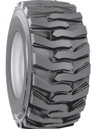
BKT SKID POWER HD/SK