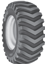
BKT SKID POWER CHEVRON