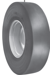
BKT PAC MASTER