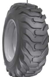
POWER KING ROAD GRADER G-2