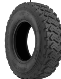
POWER KING XERT-3 RADIAL E-3-L-3