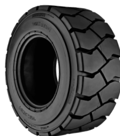
POWER KING RIM GUARD LD