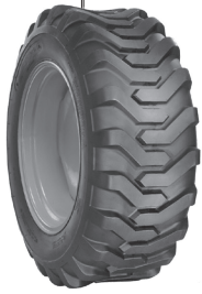
POWER KING LDR+