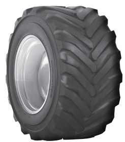
POWER KING RIM TRENCHER LUG