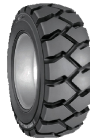
BKT POWER TRAX HD