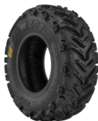
BKT WING W207