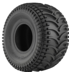
MUD & SAND