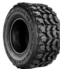
TERRA ROK A/T