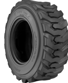
POWER KING RIM GUARD HD+