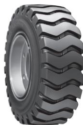
POWER KING INDUSTRIAL GRIP E-3-L-3