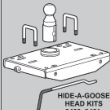
HIDE-A-GOOSE HEAD KITS 9460, 9461, 9464