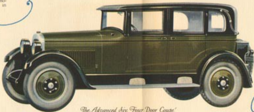
The Advanced Six Four Door Coupe.