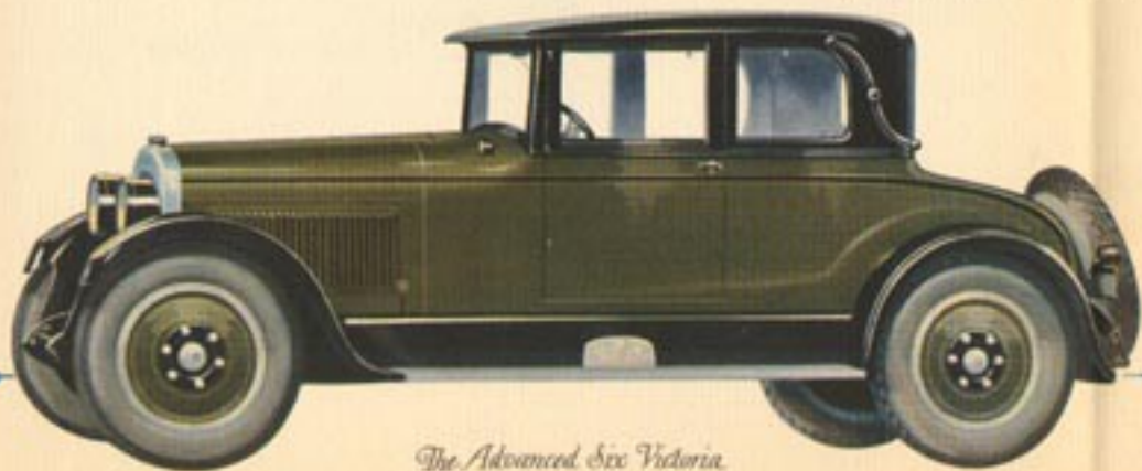
The Advanced Six Victoria.

ALL three models are mounted upon the big 127-inch Nash Advanced Six chassis, powered with the remarkable new Nash "enclosed car" motor. This motor in itself is a distinct engineering triumph, endowing, as it does, the heavier enclosed cars with all the smooth and flexible power that has heretofore been associated only with open car performance.