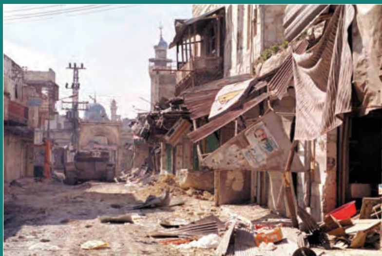
FIGURE 39 An Israeli tank in the Old City of Nablus, April 2002.

Even though the initial incentive for the conservation of the cultural heritage was politically motivated, as it stands today, there is a real interest in the protection and development of heritage for its own merits as