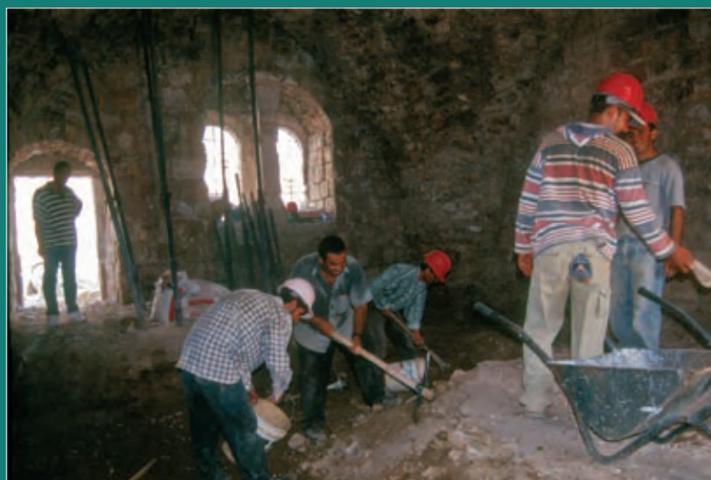
FIGURE 40 Job creation through restoration projects, 2002–6.