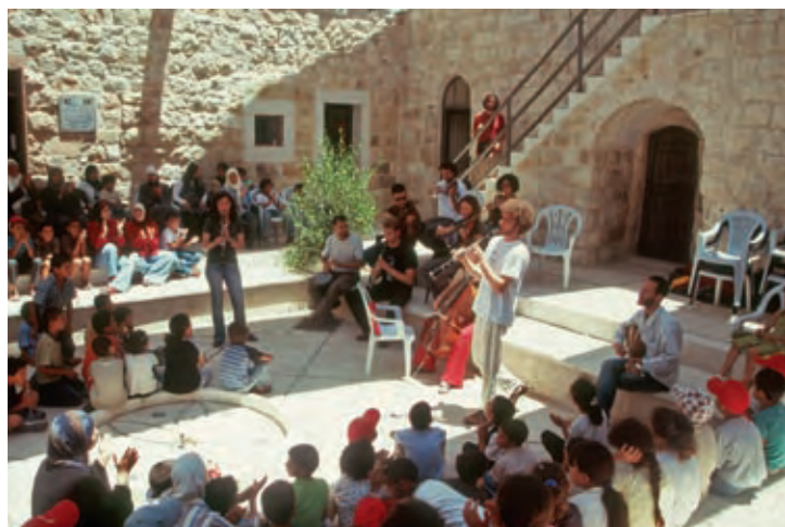
FIGURE 41 Recovery under fire: community activity in the renovated building of Beit Reema Cultural Centre.