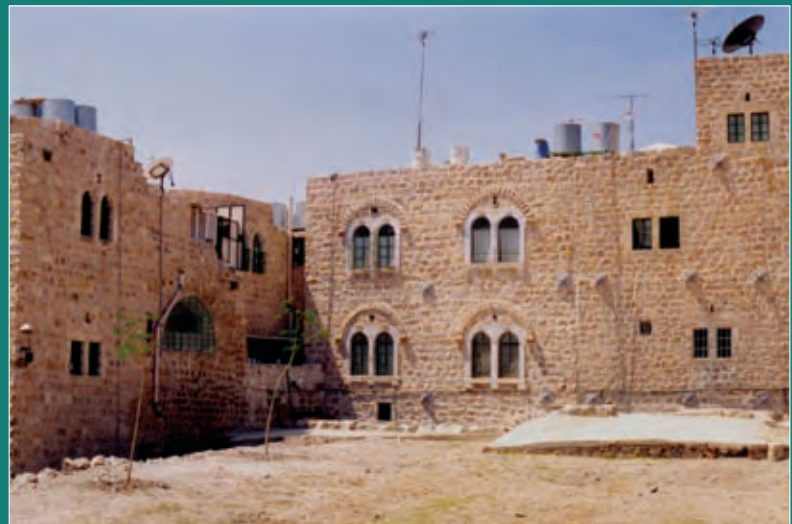
FIGURE 37 Hebron Old Town, rehabilitated quarters.